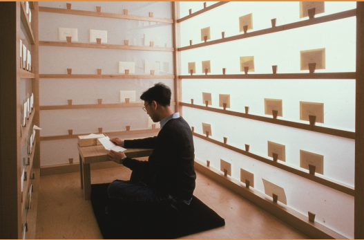
宣传图为《给自我的一封信》的姐妹作品《鱼雁计划》,2000年于“共鸣经济”展出现场, 戴维斯美术馆, 卫斯理, 美国。 Image of The Letter Writing Project , the sister project of Letter to Oneself , Installation view at "Empathic Economies," Davis Museum, Wellesley, 2000.