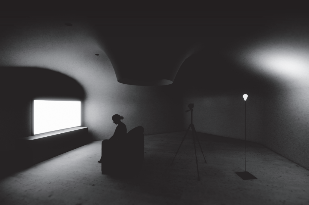
冯晨,《光的背面:瞬间》, 2020, LED灯、灯架、RGB程序控制器、摄像机, 尺寸可变。 Feng Chen, The Darker Side of Light: Moment , 2020, LED light, light stand, programmable RGB controller, camera, dimensions variable.

Scan the QR code to listen to the complete audio guide for “A Call to Attention.”